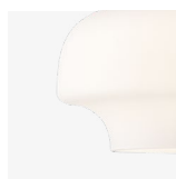
→ Opal Glass