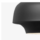
→ Matt Black