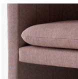
Steelcut Quartet 0354