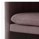
Steelcut Quartet 0356