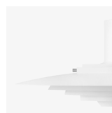
→ Matt White